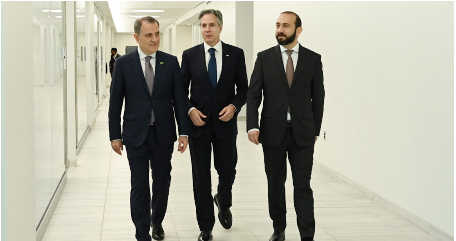
U.S. - U.S. Secretary of State Antony Blinken meets Armenian Foreign Minister Ararat Mirzoyan and Azerbaijani Foreign Minister Jeyhun Bayramov, Washington, June 27, 2023.

Closing the talks, Blinken said the two sides had made “further progress” on “the objective of reaching an overall final agreement in the weeks and months ahead” on Nagorno-Karabakh, a breakaway region under effective Armenian control.