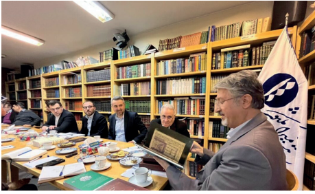
On a visit to Iran, the Matenadaran

delegation had a meeting with the leadership of the Scientific Research Center for the Study and Publication of Written Heritage in Tehran.