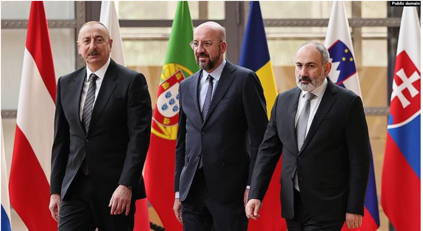
Belgium - European Council President Charles Michel hosts talks between the leaders of Armenia and Azerbaijan in Brussels, May 14, 2023

The leaders of Armenia and Azerbaijan again pledged to recognize each other's territorial integrity, the European Union's top official, Charles Michel, said after hosting fresh talks between them on May 14.