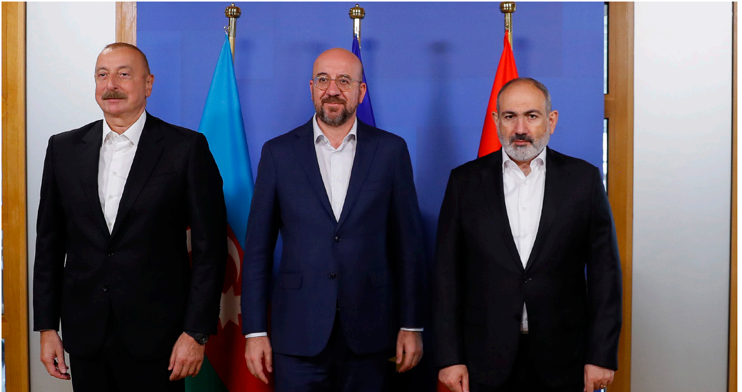
Belgium - EU Council President Charles Michel meets the leaders of Armenia and Azerbaijan in Brussels, July 15, 2023.

Armenian Prime Minister Nikol Pashinyan and Azerbaijani President Ilham Aliyev met in Brussels on July 15 for fresh talks hosted by the European Union's top official, Charles Michel.