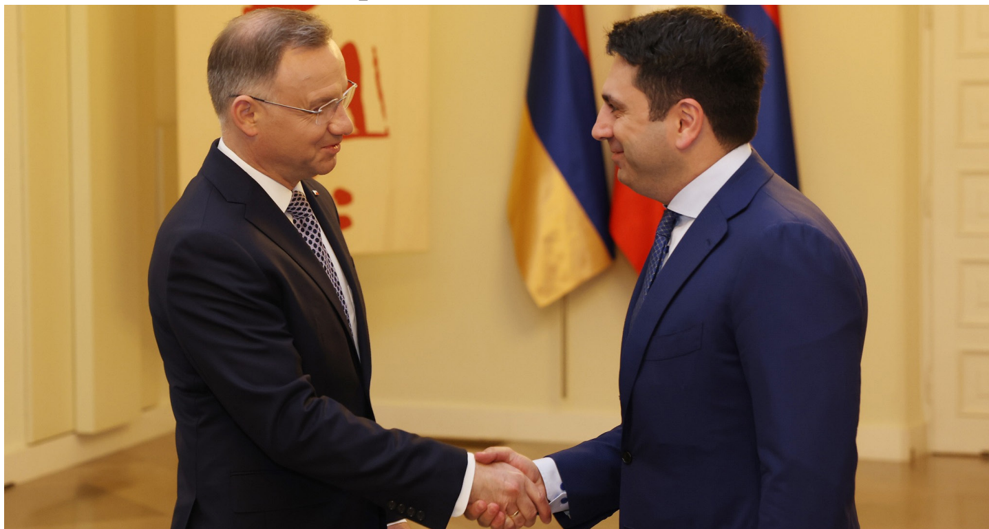
Poland - Polish President Andrzej Duda meets Armenian parliament speaker Alen Simonyan, Warsaw, July 4, 2023.

The President of Poland Andrzej Duda received the delegation led by the RA NA President Alen Simonyan in Warsaw, Armenian parliament's Press office reports.