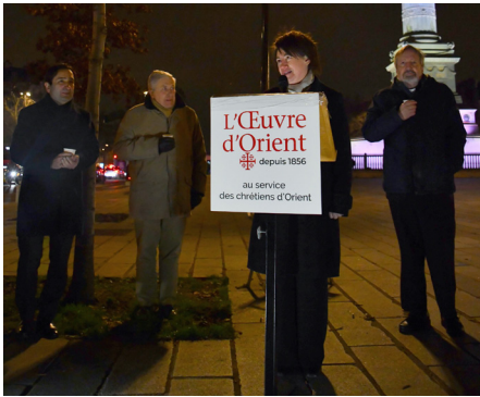
Photo exhibition in Place de la Bastille of Paris raises awareness about Nagorno- Karabakh's at-risk Armenian heritage

Paris has opened a photo exhibition in the Place de la Bastille on the endangered Armenian heritage of Nagorno-Karabakh.