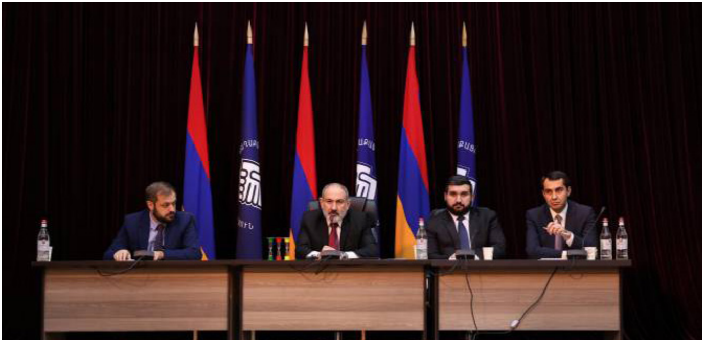
Nikol Pashinyan, at the meeting of the ruling Civil Contract party in Gavar, January 13, 2024.

The latest statements coming out of Azerbaijan are a serious blow to the peace process, Armenian Prime Minister Nikol Pashinyan said on January 13.