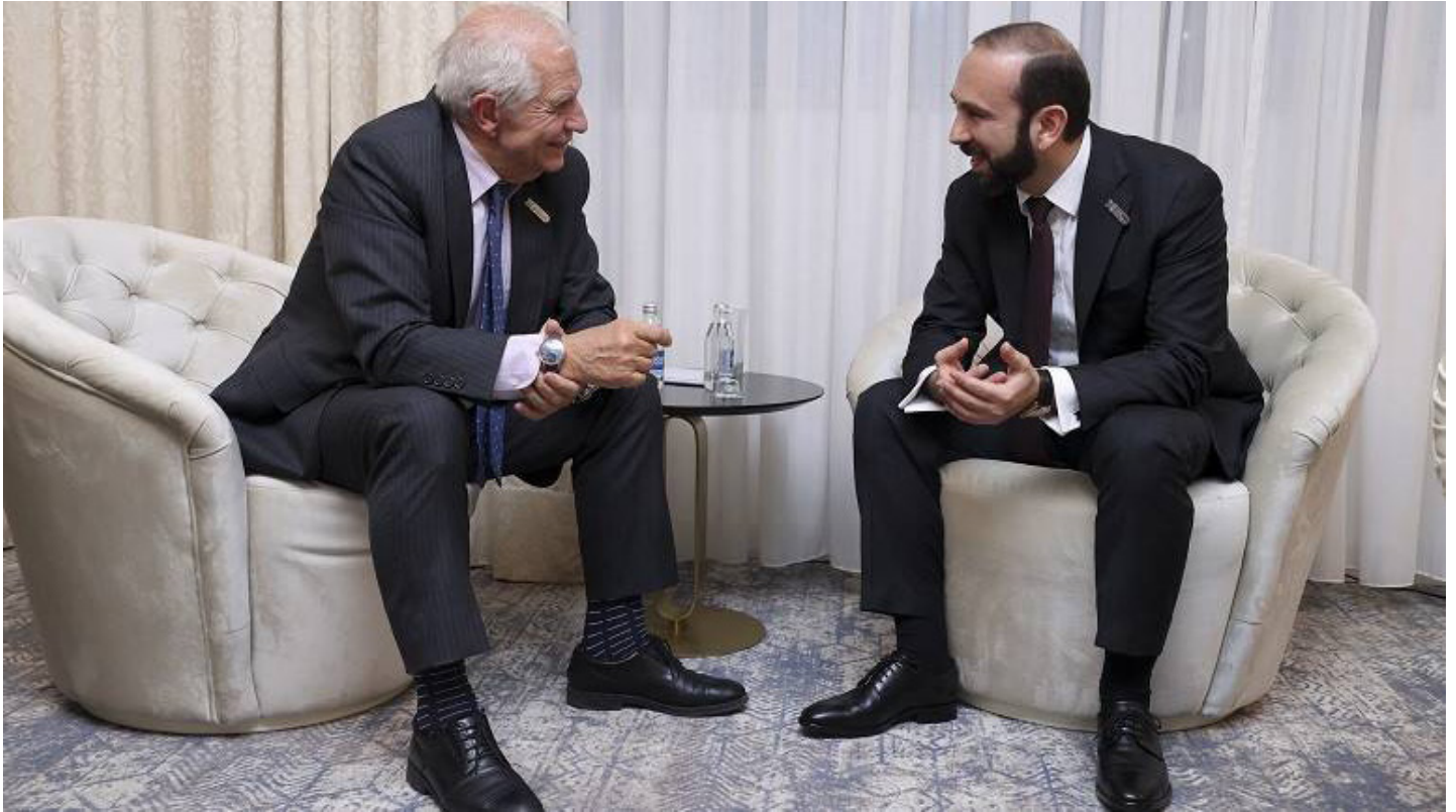
North Macedonia - EU foreign policy chief Josep Borrell and Armenian Foreign Minister Ararat Mirzoyan meet in Skopje, November 29, 2023.

Armenian Foreign Minister Ararat Mirzoyan had a meeting with EU High Representative for Foreign Affairs and Security Policy Josep Borrell on the sidelines of the OSCE Ministerial Council in Skopje.