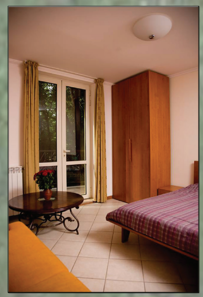
All Conveniences Air Conditioned Apartments

Warm Welcome 24/7 Security Free Cafe & Bar