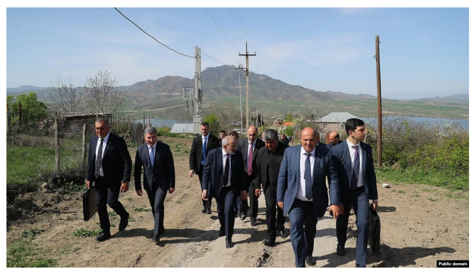
Armenia - Prime Minister Nikol Pashinian visits a border village in Tavush province, April 17, 2024.

The border areas in question are adjacent to several villages in Armenia's northern Tavush province. Many of their residents are strongly opposed to their