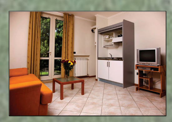
Kitchen, Refrigerator Safe, TV, Internet