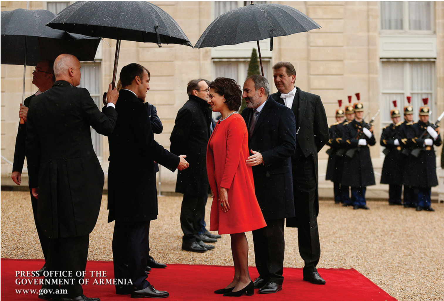
PRESS OFFICE OF THE GOVERNMENT OF ARMENIA www.gov.am

Armenia’s acting Prime Minister Nikol Pashinyan participated on November 11 in the 100th anniversary of World War I Armistice commemoration event in Paris, France.