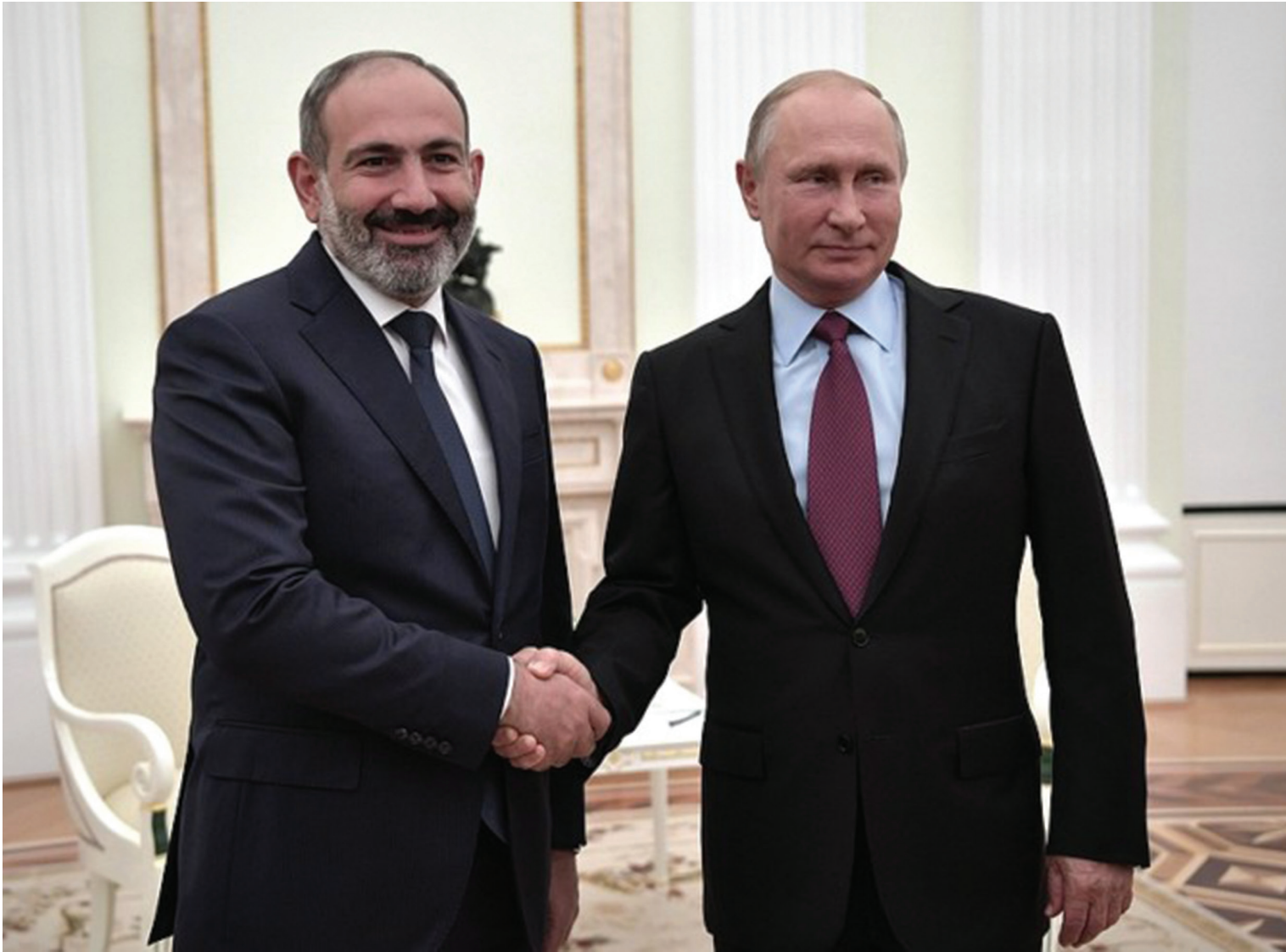
Russian President Vladimir Putin meets with Armenian Prime Minister Nikol Pashinyan in Moscow, Russia, 8 Sept. 2018