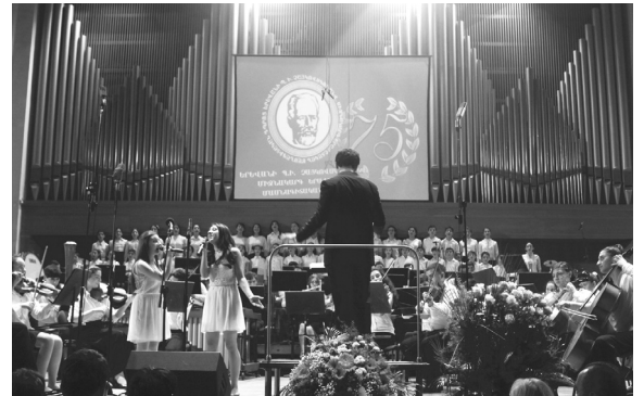
"God Angels" performed