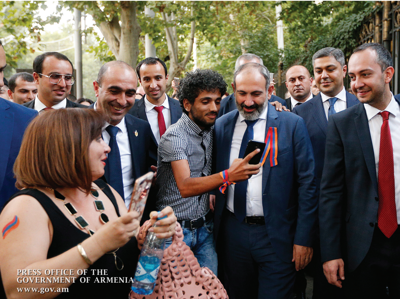
PRESS OFFICE OF THE GOVERNMENT OF ARMENIA www.gov.am

Armenia declared its independence on September 21, 1991, the day on which a referendum on freedom from the USSR took place across the country. The Republic of Armenia was accepted as a full member of the international community as a sovereign state after that, joining the United Nations in 1992. It was a dream come true for Armenians across the world to once again have Armenia on the map.