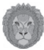
Leo (July 22–August 21)

It is important that you have mental activity this week. If your mind is not productive, then you may become irritable and say things you don't really mean. You want to take the initiative in romance and this is a good time for that. If you are with children, play really active games. Wear them out.