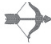
Sagittarius (November 22–December 20)

Give attention to the lead paragraph. Mercury is turning retrograde in your sign and will be more likely to affect your daily affairs than many of the other signs. Don't even try to finalize anything while a retrograding Mercury is with you. You may even reverse decisions which you have recently made.