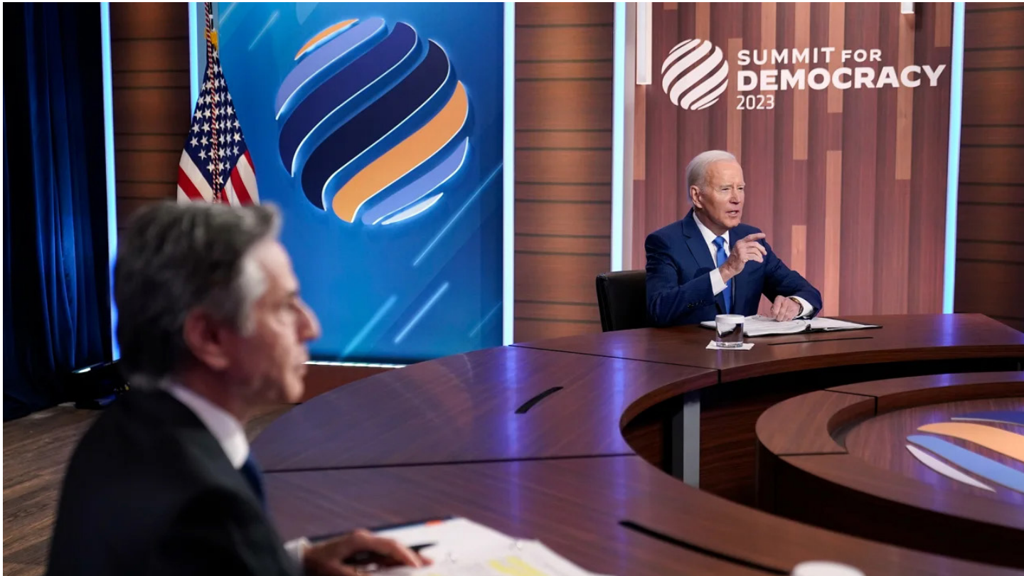
Washington, DC. - President Joe Biden speaks alongside Secretary of State Antony Blinken during a Summit for Democracy virtual plenary, March 29, 2023

Armenia has joined the Declaration adopted at the end of the plenary session of the second Summit for Democracy with a reservation.