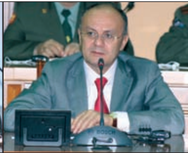
Defense Minister Seyran Ohanyan

rent Defense Minister of Armenia, Hero of Artsakh (Nagorno-Karabakh Republic), Colonel - General, Dr. Seyran M. Ohanyan