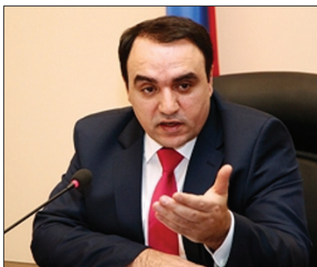
Secretary of Armenia's National Security Council, Artur Bagdasaryan

Armenia cannot expect from the OSCE Minsk Group direct criticizing of the force actions by Azerbaijan, Secretary of Armenia's National Security Council, Artur