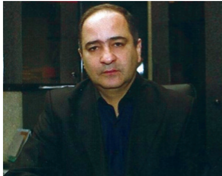
the Interpol office in Armenia, and Georgia law enforcement.