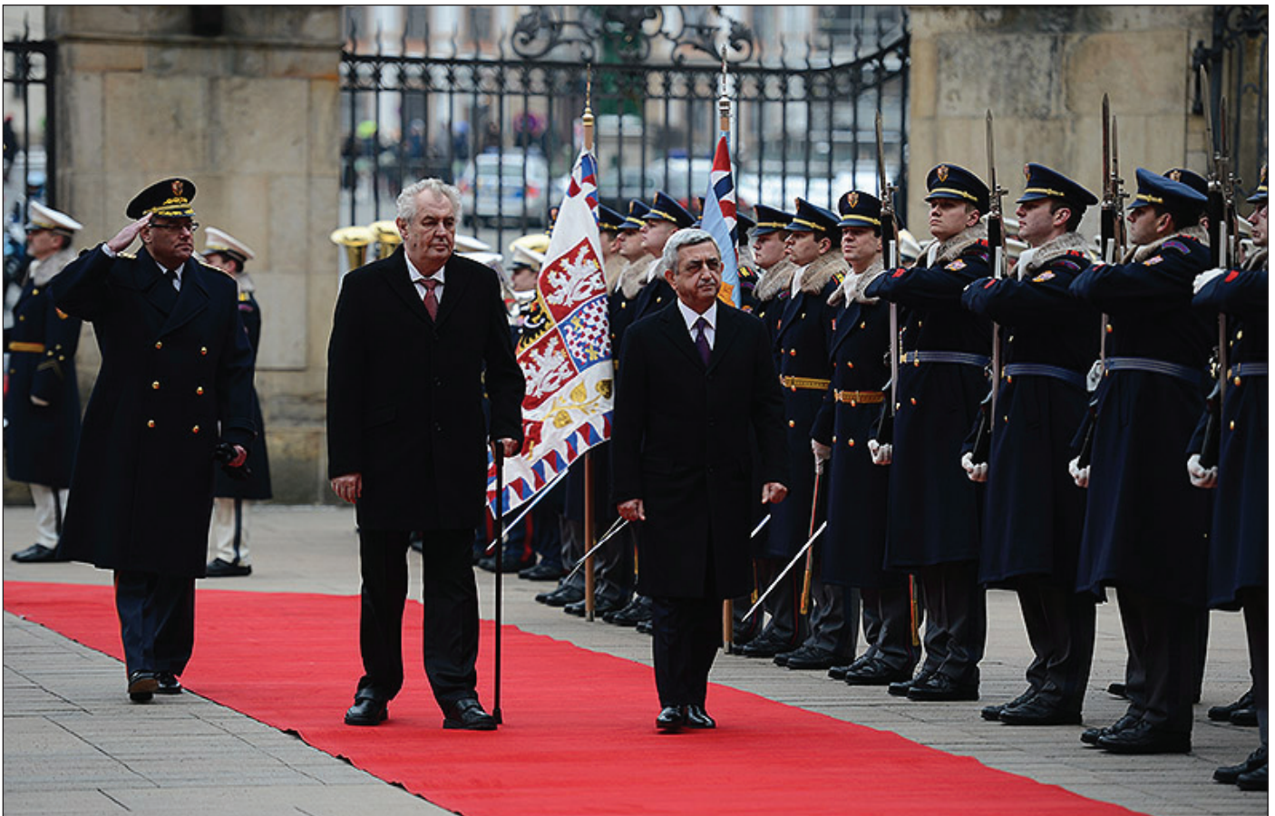
Armenian President Serzh Sargsyan with Czech President Milos Zeman in Prague, Czech Republic. Jan. 30, 2014.