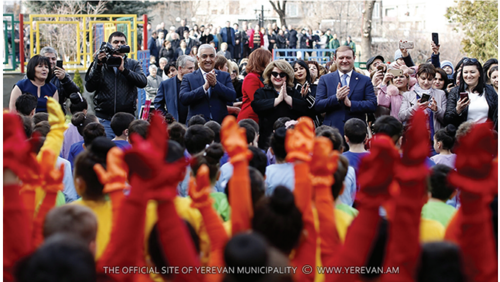
THE OFFICIAL SITE OF YEREVAN MUNICIPALITY © WWW.YEREVAN.AM

Notably, no renovation has been done in this kindergarten since its foundation, and today this nursery school having more than 40-year history has opened its doors completely renovated for 350