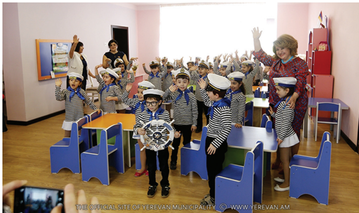
THE OFFICIAL SITE OF YEREVAN MUNICIPALITY © WWW.YEREVAN.AM