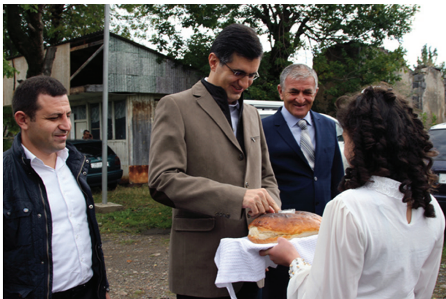
Armenian Diocese Museum in Romania.

The General Partner of the exhibition is VivaCell-MTS.