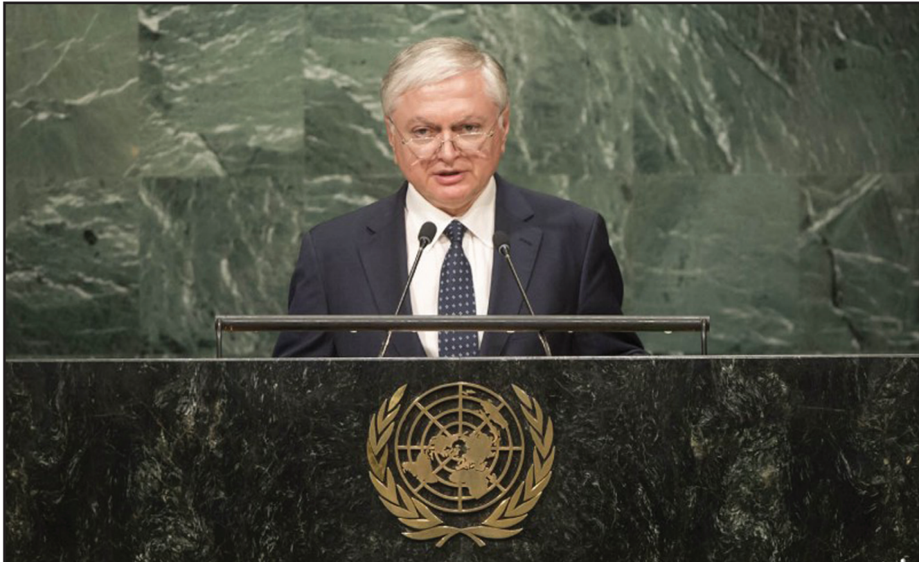
On September 21 – the 25 th anniversary of Armenia’s Independence – Armenian Acting Foreign Minister Edward Nalbandian chaired the sitting of the UN General Assembly in New York.