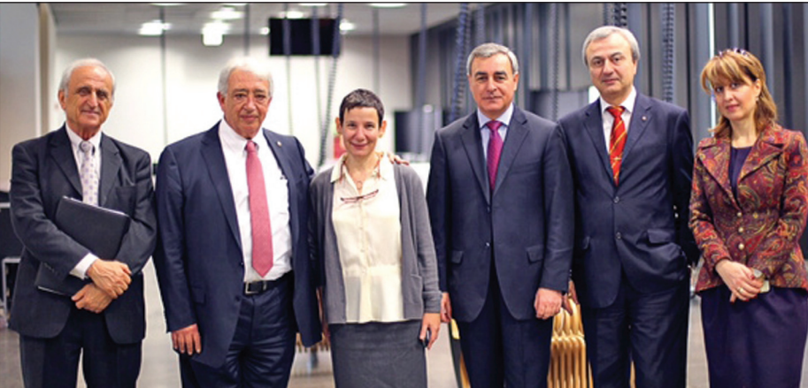
Award since its very establishment