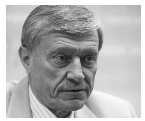
actions. It's important to ensure the continuation of the negotiation process on the settlement of the Nagorno Karabakh conflict," Bordyuzha stated.

"We are deeply convinced of the need to prevent the threatening development of the situation. The most important things that could prevent such turn of events include refusal from the use of force, unequivocal commitment to the ceasefire agreement and avoidance of provocative