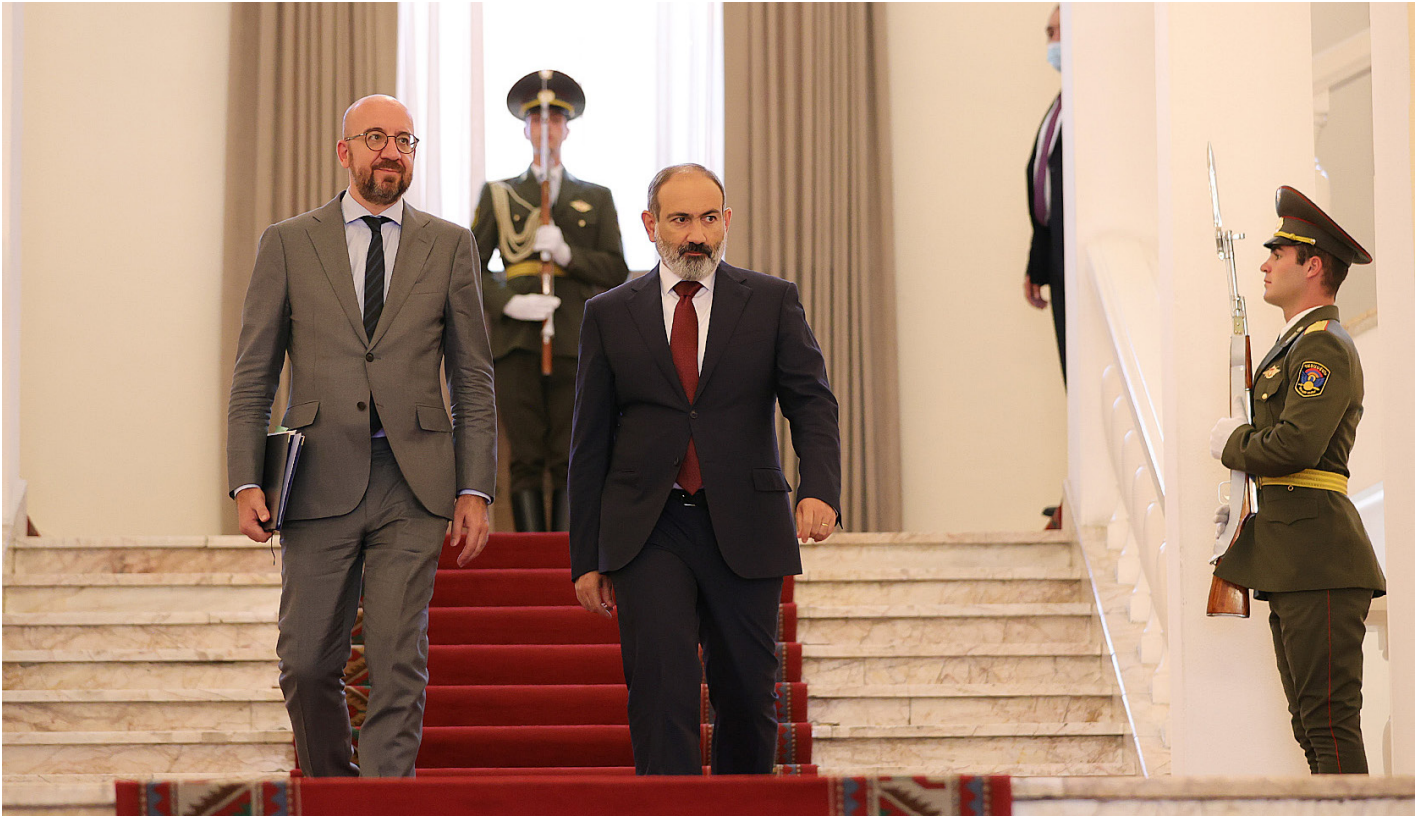
Armenia - Armenian Prime Minister Nikol Pashinyan and European Council President Charles Michel arrive for a news conference after holding talks in Yerevan, July 17, 2021.

Acting Prime Minister Nikol Pashinyan hosted a delegation led by European Council President Charles Michel, who arrived in Armenia on a working visit.