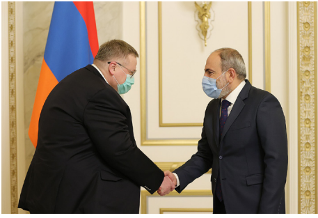
Armenia - Russian Deputy Prime Minister Alexei Overchuk at a meeting with Armenian Prime Minister Nikol Pashinyan, Yerevan, November 5, 2021.

Prime Minister Nikol Pashinyan received Deputy Prime Minister of Russia Alexei Overchuk.