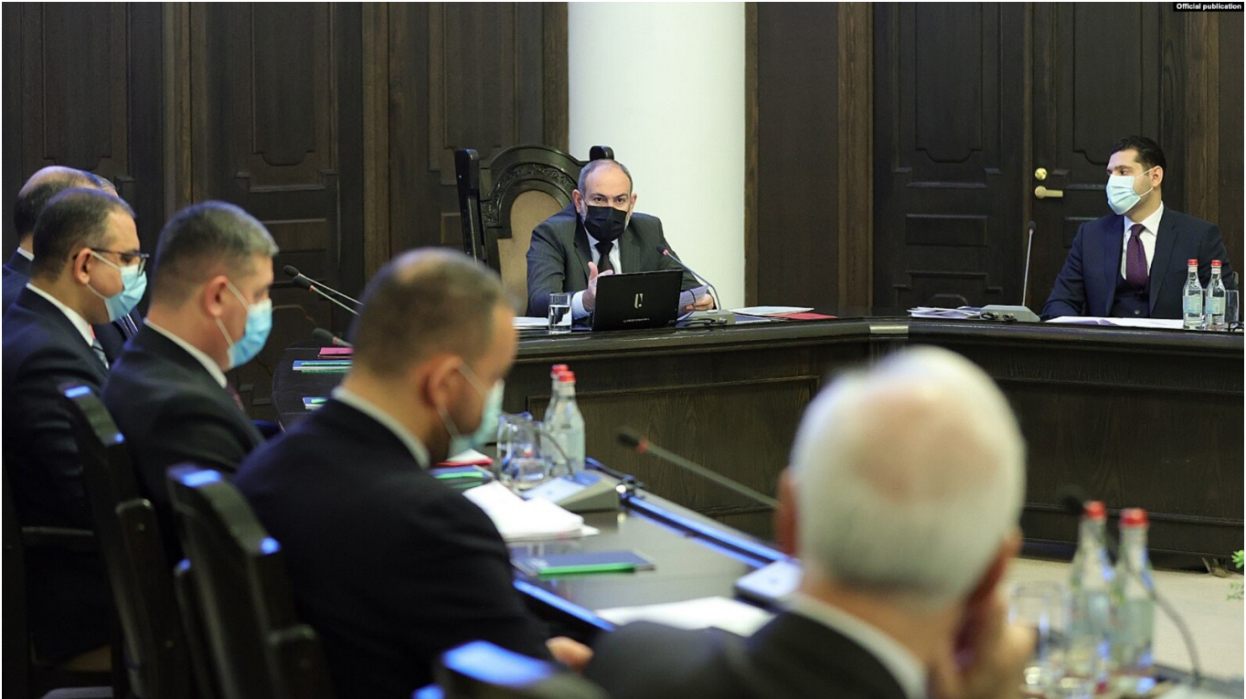
Armenia - Prime Minister Nikol Pashinyan chairs a cabinet meeting in Yerevan, February 17, 2022.

In the context of the opening of regional connections the Armenian government re-formulated the North-South project and is terming it “North-South, East-West” Project, or “Armenian Crossroads”, the Armenian Prime Minister Nikol Pashinyan said at the Cabinet meeting.