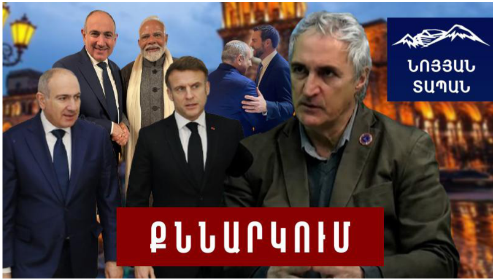
Noyan Tapan introduces: "Discussion" welcoming the Chairman of European Party of Armenia (EPA), Tigran Khzmalyan