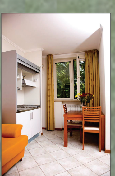
Modern Rest Rooms

Warm Welcome 24/7 Security Free Cafe & Bar