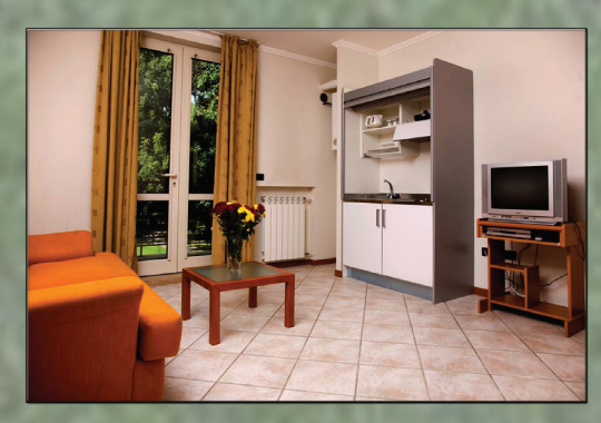
Kitchen, Refrigerator Safe, TV, Internet