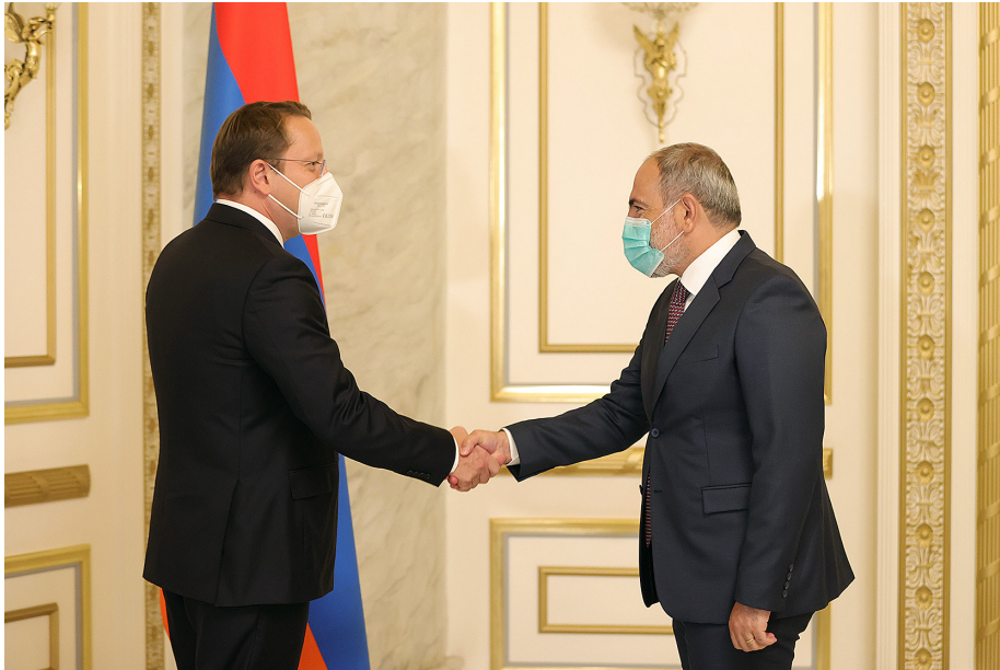
Armenia - Nikol Pashinyan meets EU Commissioner for Neighborhood and Enlargement Oliver Varhelyi in Yerevan, July 9, 2021.

Acting Prime Minister Nikol Pashinyan received a delegation led by European Commissioner for Enlargement and European Neighborhood Policy Olivér Várhelyi.