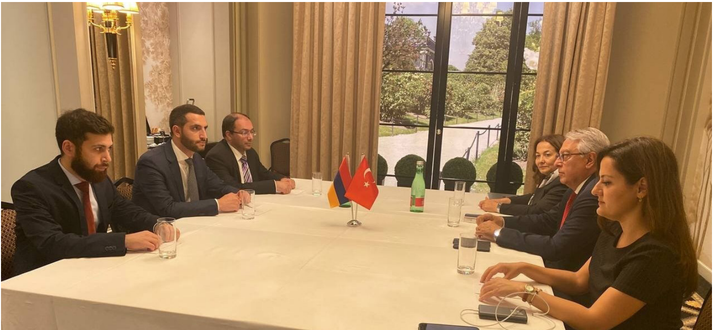
Austria – Armenian and Turkish envoys hold a fourth round of normalization talks in Vienna, July 1, 2022.

Turkey and Armenia on July 1 agreed in principle to allow citizens of third countries to cross their border which Ankara has for decades kept closed.