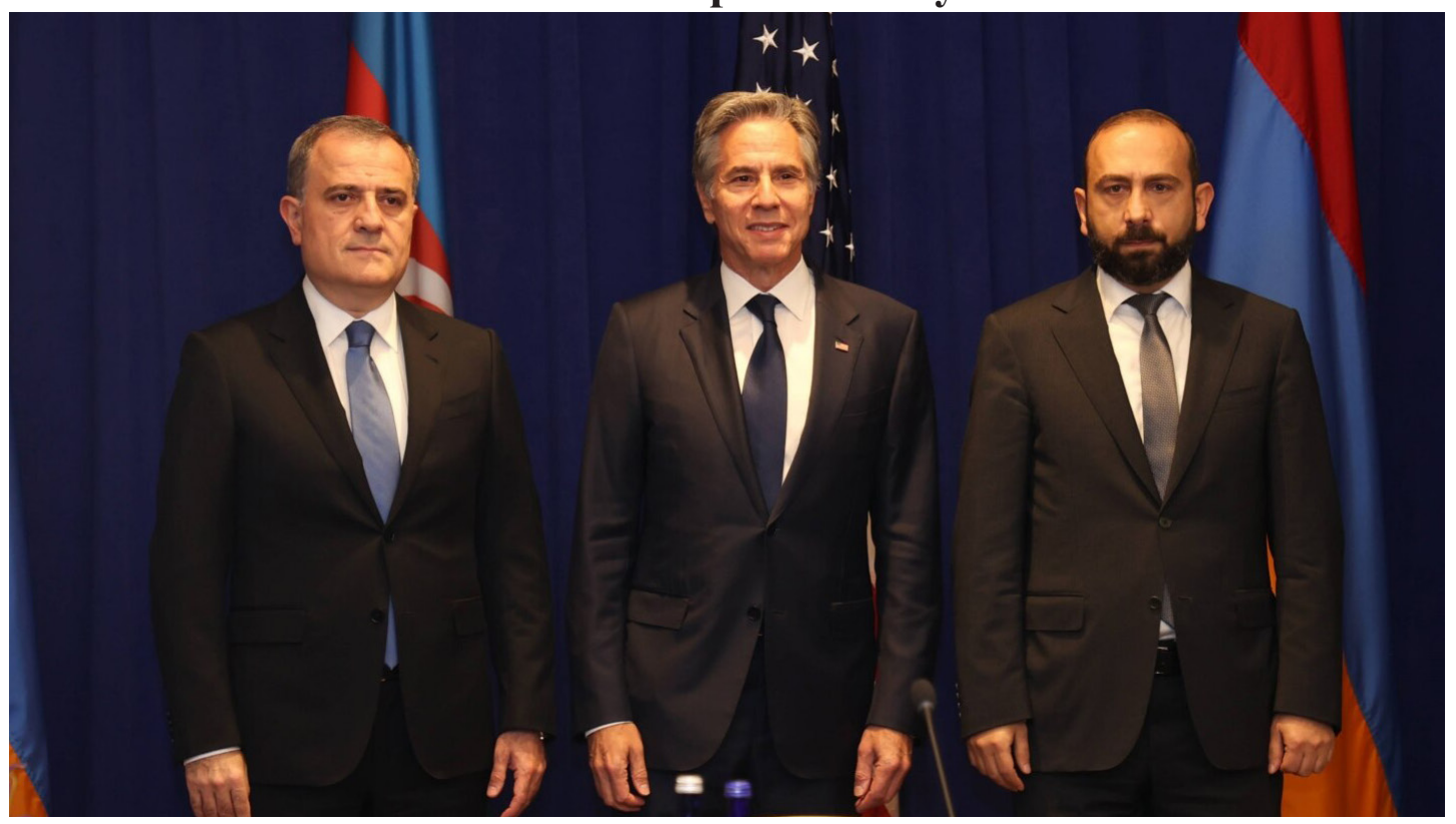
U.S. - U.S. Secretary of State Antony Blinken meets with the Armenian and Azerbaijani foreign ministers, New York, September 26, 2024.

U.S. Secretary of State Antony Blinken met with the foreign ministers of Armenia and Azerbaijan in New York on September 26 for trilateral talks on a peace deal between the two South Caucasus nations.