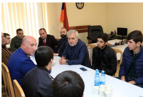
Another group of former Armenian ser-

vicemen, who were wounded in the 2020 War, will depart for Jerusalem within the framework of the charitable program “Pilgrimage to Jerusalem”, the ministry said.