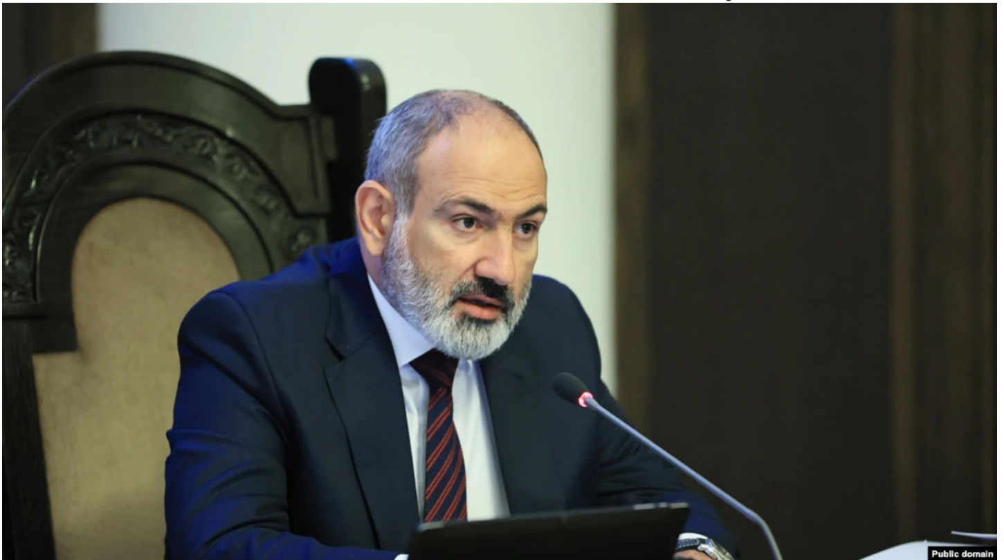
Armenian Prime Minister Nikol Pashinyan speaks during a cabinet session. November 10, 2022

Azerbaijani president Ilham Aliyev is not only threatening, but already preparing the genocide of the Armenians of Nagorno-Karabakh, Prime Minister Nikol Pashinyan said at the Government sitting on November 10.