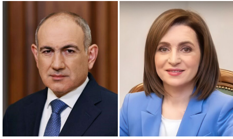
President Maia Sandu has claimed victory

and a new majority in parliament in Sunday's elections seen as critical for her country's future path to the EU.