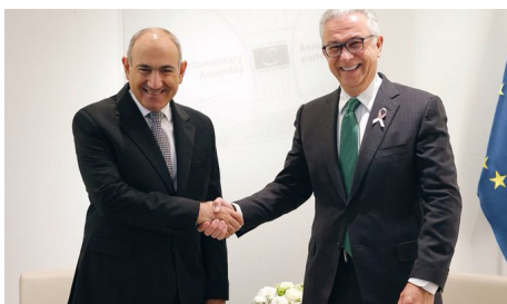
Armenian Prime Minister Nikol Pashinyan held a meeting with Theodoros

Rousopoulos, President of the Parliamentary Assembly of the Council of Europe (PACE), during his working visit to Strasbourg.