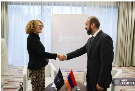
Armenian Foreign Minister Ararat Mirzoyan met with NATO Deputy Secretary

General Radmila Šekerinska on the sidelines of the Warsaw Security Forum 2025.