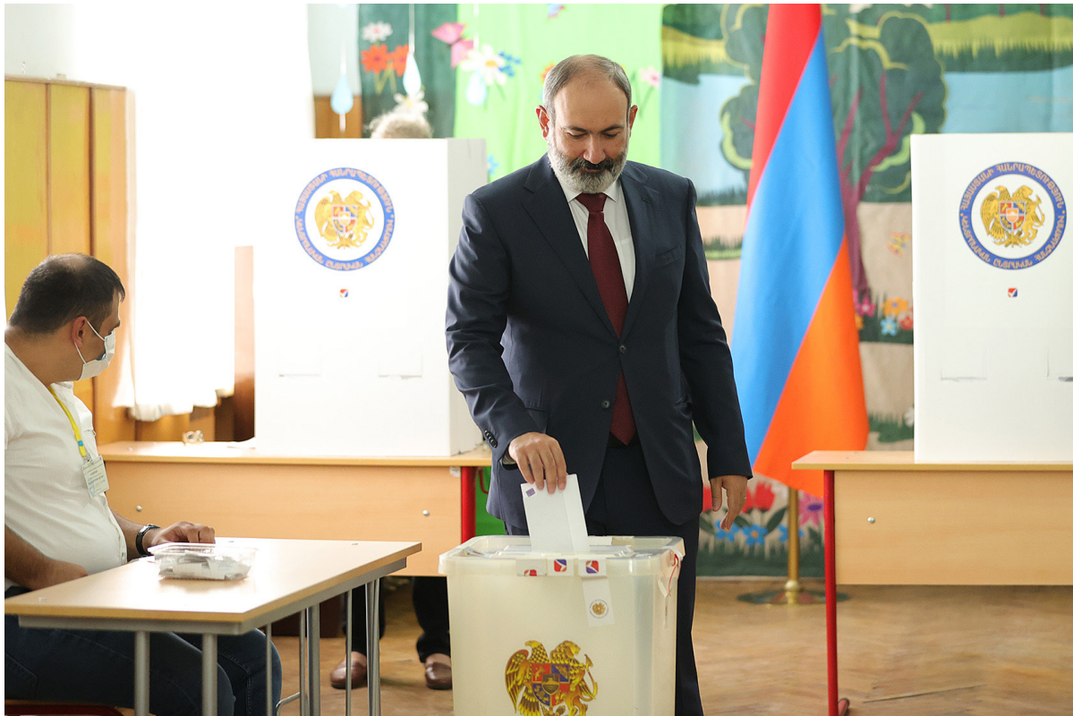
Armenia - Prime Minister Nikol Pashinyan votes at a polling station in Yerevan, June 20, 2021.

Armenia’s acting Prime Minister Nikol Pashinyan has said his Civil Contract Party will have constitutional majority and will form government, after the Central Electoral Commission announced results from all polling stations.