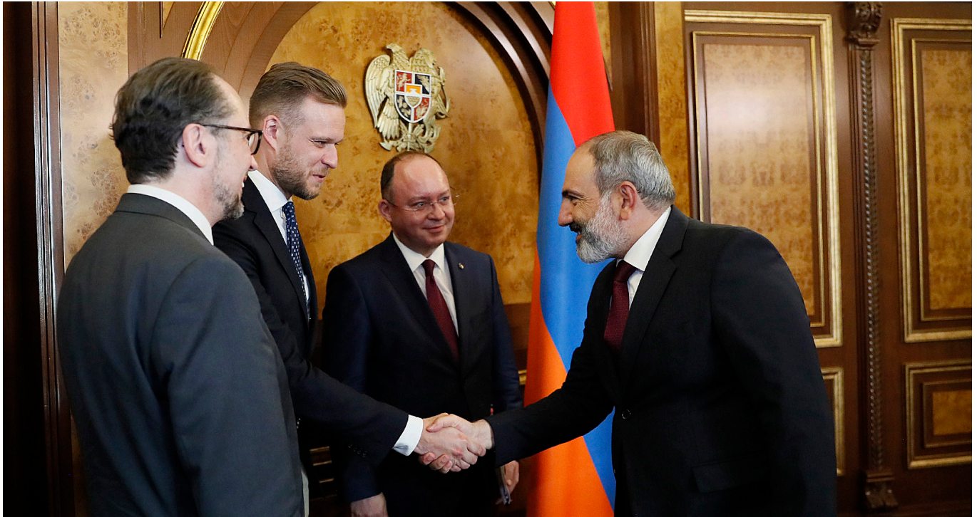
Armenia - The foreign ministers of Austria, Lithuania and Romania meet with acting Prime Minister Nikol Pashinyan, Yerevan, June 25, 202

Acting Prime Minister Nikol Pashinyan received Romanian Foreign Minister Bogdan Aurescu, Lithuanian Foreign Minister Gabrielius Landsbergis, Austrian Federal Minister for European and International Affairs Alexander Schallenberg, and EU Special Representative for the Caucasus and the Crisis in Georgia Toivo Klaar. The visit is authorized by EU High Representative for Foreign Affairs and Security Policy Joseph Borrell.