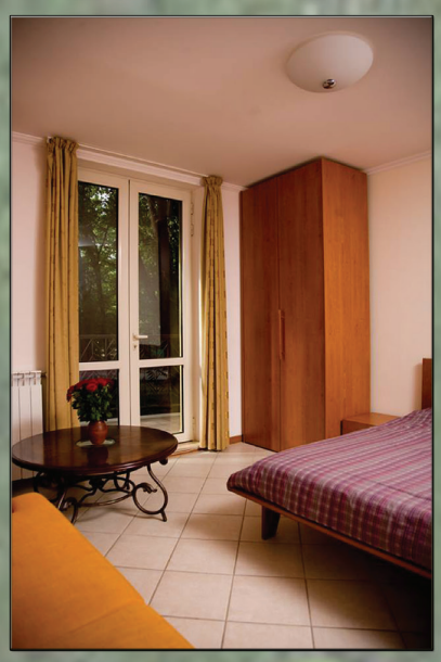
All Conveniences Air Conditioned Apartments

Warm Welcome 24/7 Security Free Cafe & Bar