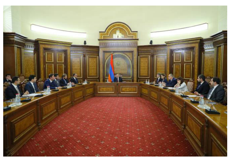
stated that it is necessary to formulate the motivations correctly and emphasize that

the government has adopted a policy to completely abandon the turnover tax in Armenia, as it distorts the economy, the tax system, and creates an unhealthy economic environment. According to Nikol Pashinyan, it should be implemented in a phased manner, moving towards a unified single tax system.