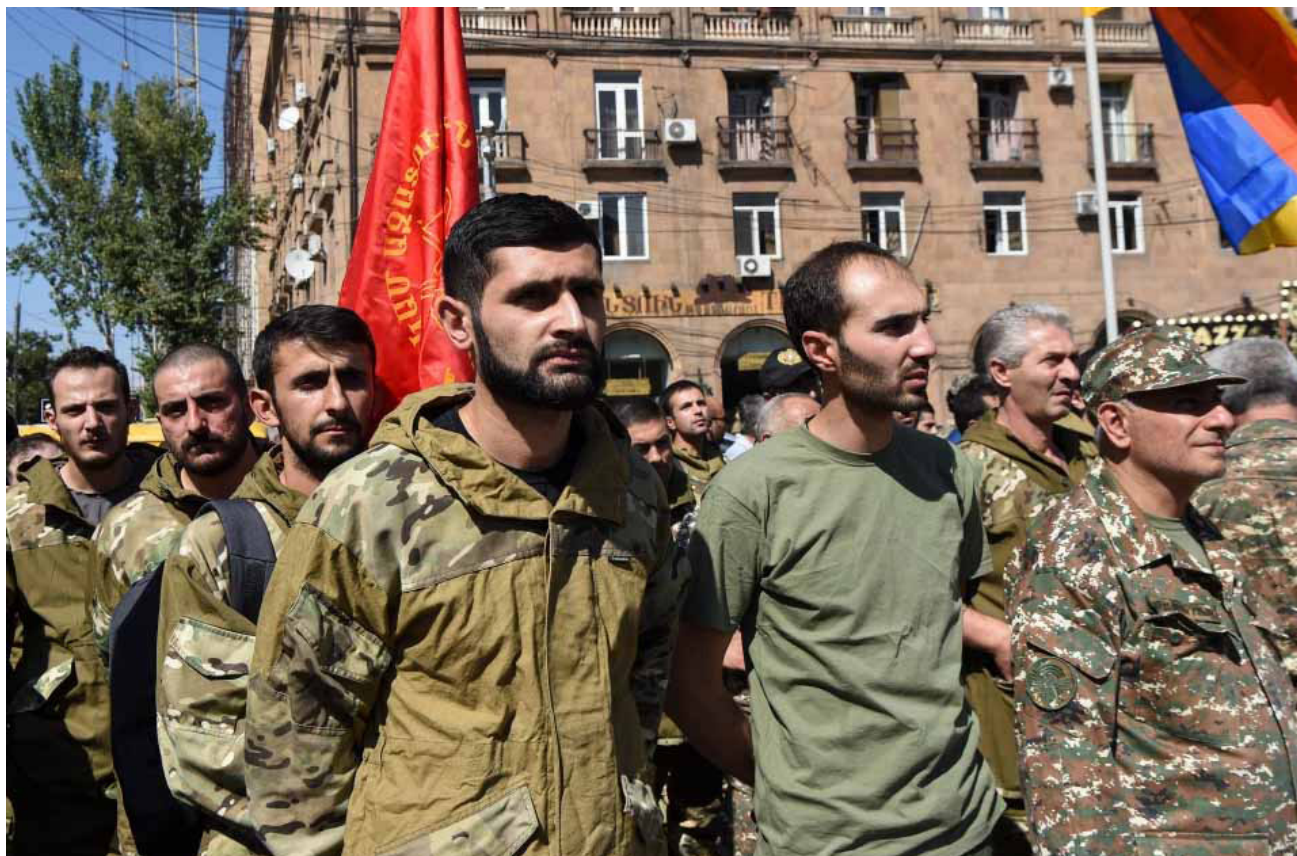
Volunteers of Armenian Revolutionary Federation gather to leave for Artsakh, Yerevan, September 27, 2020.

Armenia declared martial law and general military mobilization on September 27 following the outbreak of large-scale hostilities around Artsakh.