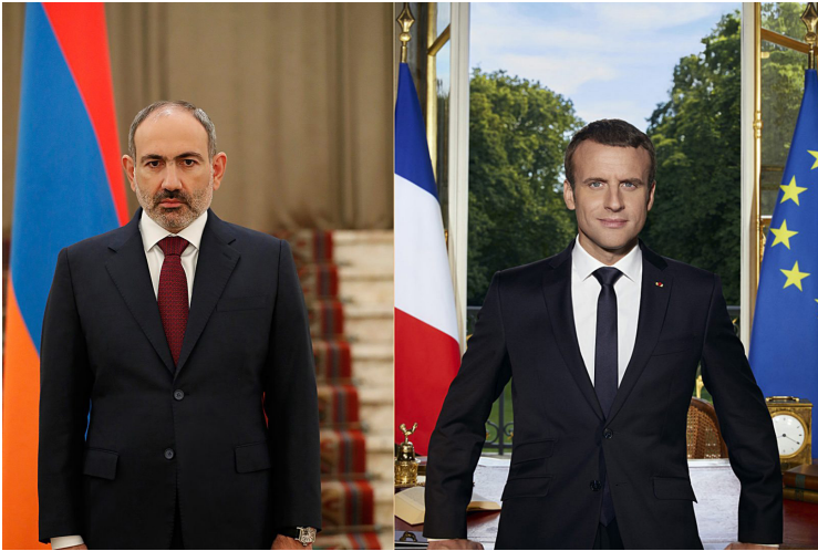
Prime Minister Nikol Pashinyan held a

telephone conversation with President of France Emmanuel Macron.