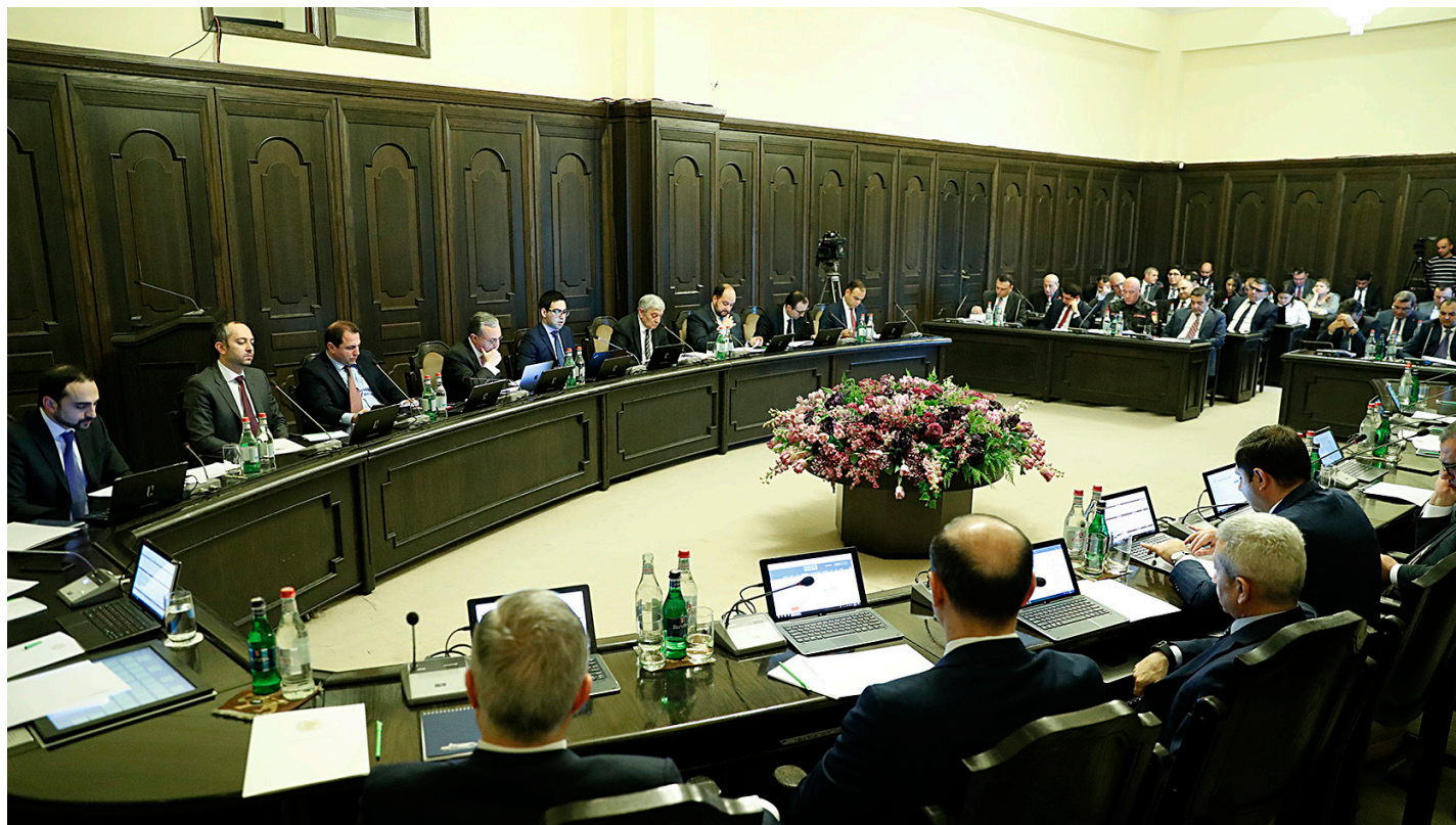
The Armenian Government convened for a special meeting on March 16, 2020 to declare a month-long state of emergency

Citing the need to contain the further spread of a potentially deadly novel coronavirus, the Armenian government on March 16 declared a state of emergency, introducing a range of limitations for Armenian citizens and partially prohibiting entry into the country for foreigners.