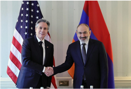
The U.S. State Department has issued

a readout of the latest phone call between Secretary of State Antony Blinken and Armenian Prime Minister Nikol Pashinyan.