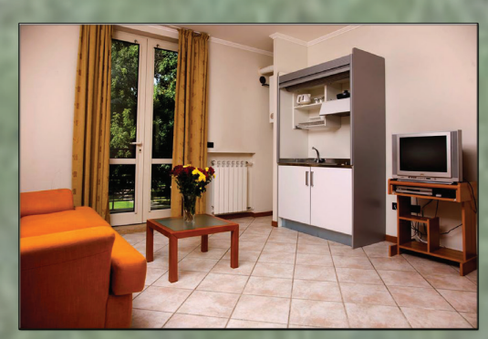
Kitchen, Refrigerator Safe, TV, Internet