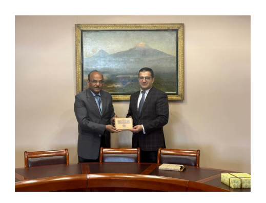
manuscripts and archival documents.

The discussion mainly focused on research, restoration, and digitization of