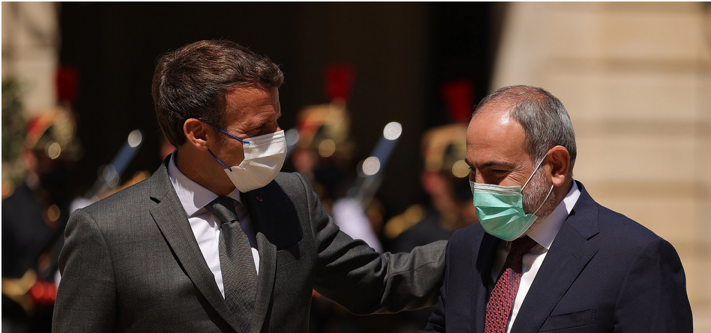
France - Nikol Pashinyan, Emmanuel Macron meet at Elysee Palace in Paris, June 1, 2021

French President Emmanuel Macron again demanded that Azerbaijan withdraw its troops from Armenia’s border areas when he met with Prime Minister Nikol Pashinyan in Paris on June 1.