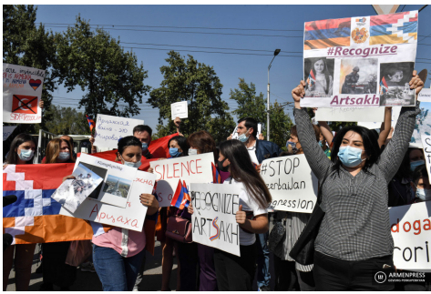
Multiple citizens in Armenia are holding a protest outside the US Embassy in Yerevan, trying to draw the US attention on the