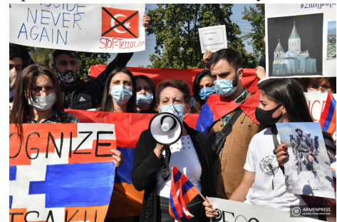
van, trying to draw the US attention on the

ongoing atrocities committed by the Turkish-Azerbaijani forces, Syrian mercenaries against Artsakh, urging the US Ambassador or any representative of the Embassy to visit Artsakh’s capital Stepanakert, Shushi or other cities to see the results of these