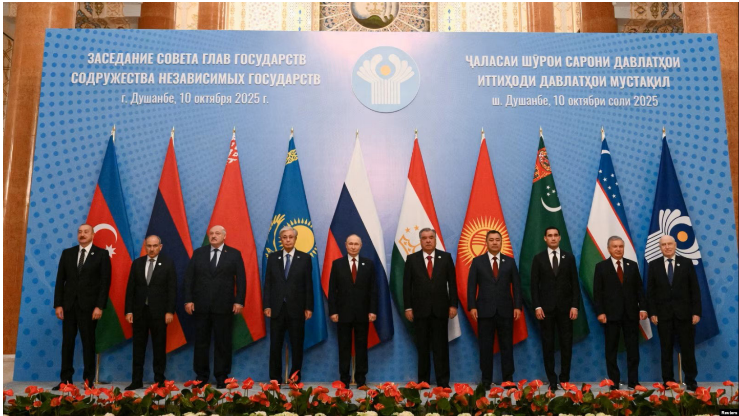
T ajikistan - The leaders of Azerbaijan, Armenia, Belarus, Kazakhstan, Russia Tajikistan, Kyrgyzstan, Turkmenistan and Uzbekistan pose for a photo during a CIS summit in Dushanbe, October 10, 2025.

Prime Minister of Armenia Nikol Pashinyan participated in the regular meeting of the Council of Heads of State of the Commonwealth of Independent States (CIS) held in Dushanbe, Tajikistan. The meeting was hosted by President Emomali Rahmon and began with a ceremonial group photo before proceeding to the working sessions. In his address, Prime Minister Pashinyan highlighted the establishment of