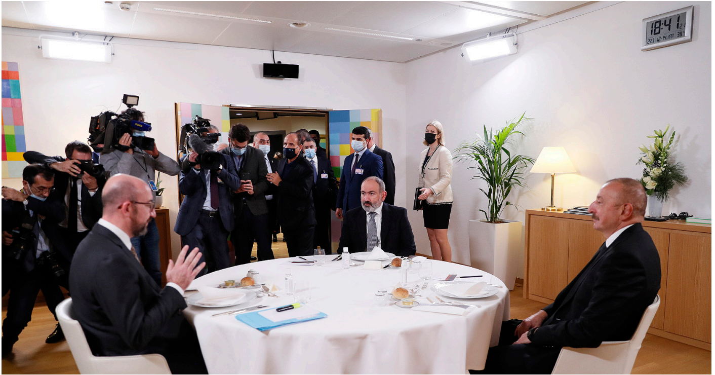
Armenia - European Council President Charles Michel, Armenian Prime Minister Nikol Pashinyan and Azerbaijani President Ilham Aliyev meet in Brussels, December 14, 2021.

The trilateral meeting of the Prime Minister of the Republic of Armenia Nikol Pashinyan, the President of the European Council Charles Michel and the President of the Republic of Azerbaijan Ilham Aliyev took place in Brussels.