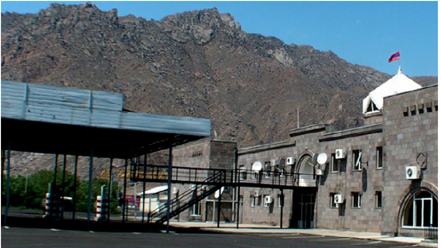
Armenia - A cargo terminal at a border crossing with Iran, November 29, 2018.

From January 1, 2025, the border guard troops of the Armenian National Security Service will also participate in the protection of the Armenia-Iran and Armenia-Turkey state borders. The agreement was reached during the meeting between Armenian Prime Minister Nikol Pashinyan and Russian President Vladimir Putin, Prime Minister’s Spokesperson Nazeli Baghdasaryan said in a Facebook post.