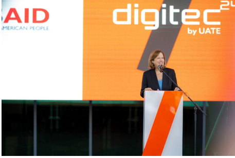
USAID empowers Armenia's tech

sector and drives economic development, the U.S. Embassy in Armenia said in a press release.