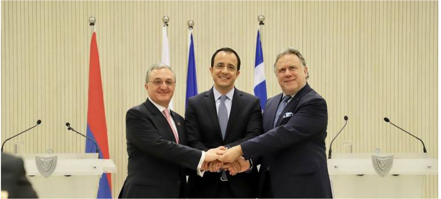
Cyprus -- Foreign Ministers Nikos Christodoulides (C) of Cyprus, George Katrougalos of Greece (R) and Zohrab Mnatsakanyan of Armenia shake hands after talks held in Nicosia, June 4, 2019.