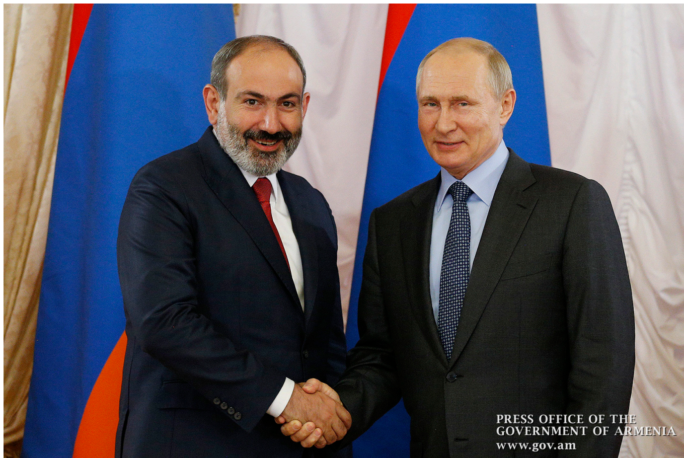
PRESS OFFICE OF THE GOVERNMENT OF ARMENIA www.gov.am