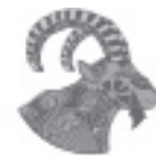
Capricorn (December 21–January 19)

Listen to Shakespeare’s wisdom: “Neither a borrower nor a lender be.../for loan oft loses both itself and a friend.” Opportunities come your way for one or more creative ventures from a distance, via the law, education, travel, or the internet