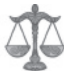
Libra (Sep. 23–Oct. 22)

Venus enters your sign this week and will be traveling “with you” through all of June. Her presence gives you an air of poise and people will simply like how you look. Often when Venus is prominent we become more interested in art forms and want to make things in the environment more attractive. We are also more interested in beautifying ourselves.