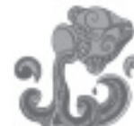
Aquarius (January 20–February 17)

You may feel a sense of abandonment from partner(s), clientele, or those with whom you consult (lawyers, doctors). It hurts for a short time, but soon you will find ways to fill in the gap. You need more information to assist you in understanding this loss. Don’t allow others to lay blame upon you for things you haven’t done