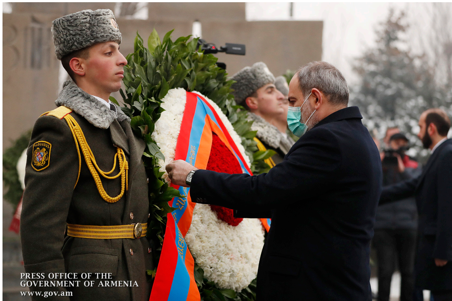
Armenia - PM Pashinyan pays tribute to the memory of fallen soldiers, Yerevan, January 28, 2021

Prime Minister Nikol Pashinyan visited the Yerablur Military Pantheon on the occasion of the Army Day to pay tribute to the memory of soldiers fallen for the independence of the Homeland.