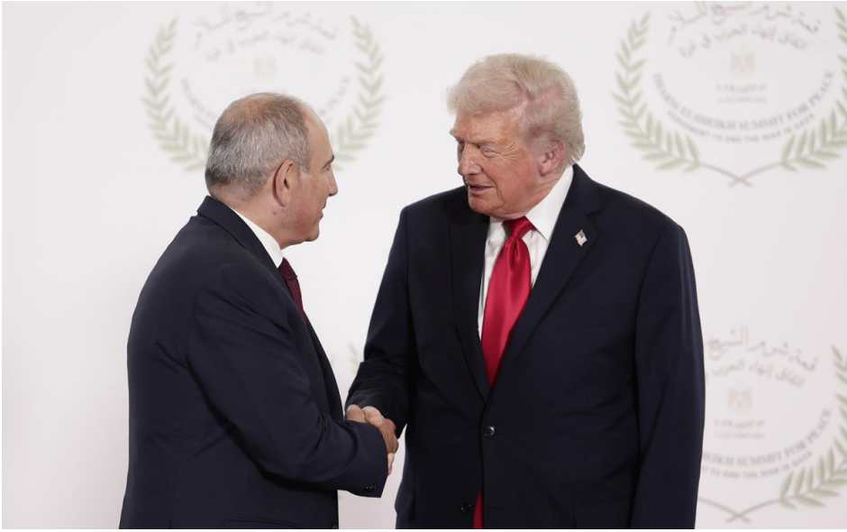
Prime Minister Nikol Pashinyan participated in the Middle East Peace

Summit in Sharm El Sheikh at the invitation of US President Donald Trump and Egyptian President Abdel Fattah al-Sisi.