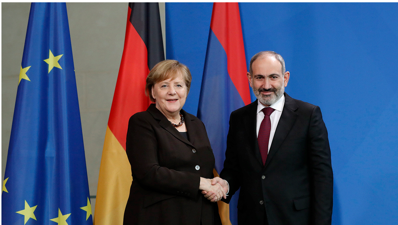
Germany -- Armenian Prime Minister Nikol Pashinyan and German Chancellor Angela Merkel meet at the Chancellery in Berlin, February 13, 2020

Armenian Prime Minister Nikol Pashinyan had a meeting with German Chancellor Angela Merkel in Berlin. Welcoming the visit of the Armenian Prime Minister, Mrs. Merkel said it provides an opportunity to discuss issues on the agenda of bilateral relations.