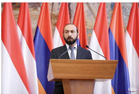
The Minister of Foreign Affairs of the

Republic of Armenia Ararat Mirzoyan, during a joint press conference with the Minister of Foreign Affairs of Hungary Péter Szijjártó expressed his confidence that the programs of Armenia and the European Union will progress significantly during Hungary's presidency.