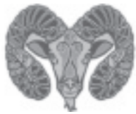
Aries (March 20–April 19)

The eclipse will focus a certain amount of intensity in the arenas of career (work in the world) and also home, hearth and family and security. You will stretch your worldly boundaries in the next 18 months to serve a new group of people. Family relationships will include one loss and one gain. This includes pets.