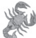
Scorpio (October 23–November 21)

Your sense of personal identity becomes the subject under consideration. Who are you becoming and who do you need to be? How do you wish to define yourself before the world? You will be learning what is required for you to hold onto your identity while simultaneously maintaining a personally rewarding relationship.