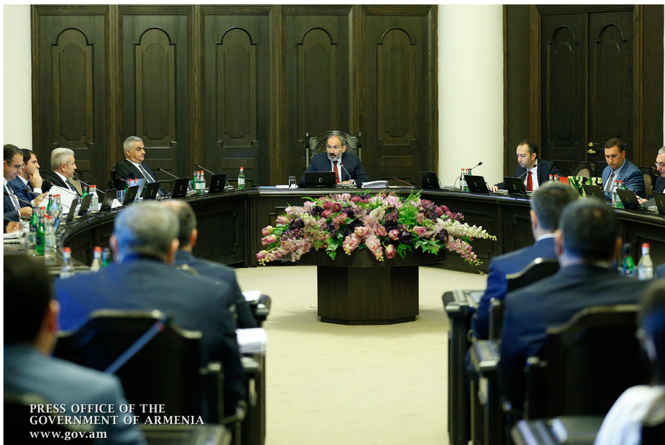
Armenia - Cabinet meeting, chaired by Prime Minister Nikol Pashinyan, June 27, 2019.

The Armenian government announced on June 27 plans to increase the minimum wage in the country by more than 23 percent. A bill drafted by two members of Armenia's parliament and discussed by the government at a weekly meeting in Yerevan would raise it from 55,000 drams ($115) to 63,000 drams per month.