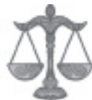
Libra (Sep. 23–Oct. 22)

During this new 18-month series of eclipses you will be learning to value yourself in new ways. Alongside of that comes education in the management of money and other resources, such as time and energy. There will be less assistance from others in these arenas, but you are creating these resources for yourself.