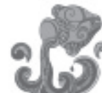
Aquarius (January 20–February 17)

Matters concerning your career, family and property will be accented for the next 18 months. Old problems in relationships, even with the deceased, will surface for cleansing and healing. A new family member may enter the scene, or you may begin to spend more time with family in general.