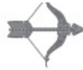
Sagittarius (November 22–December 20)

The new series of eclipses emphasize your need to create order, both internally and externally. The development of your projects will call upon you to develop faith in your deepest self. Bringing order out of chaos is done on both the inner and outer levels simultaneously, so while you organized files you will be also organizing your mind.