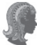
Virgo (August 22–September 22)

Please read the lead paragraph. Planetary energies in your sign are intense. Your “devotion” may have to be to yourself at this time. Maybe the static is so loud that you feel the need to back away, take a break, or relieve the pressure with R&R. Perhaps you have spent far too much energy taking care of others.