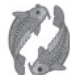
Pisces (February 18–March 19)

Legal, ethical or educational issues will be emphasized by the new 18 month series of eclipses. Travel will be punctuated, whether it via body, mind, or spirit. Exposure to those of different backgrounds or cultures opens your heart and expands your philosophy.