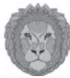
Leo (July 22–August 21)

The eclipse will focus a certain amount of intensity in the arenas of career (work in the world) and also home, hearth and family and security. You will stretch your worldly boundaries in the next 18 months to serve a new group of people. Family relationships will include one loss and one gain. This includes pets.