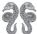
Gemini (May 20–June 20)

The eclipses of this new 18 month series will draw your attention to your partnerships. Patterns from your childhood history needed to be uncovered, repaired or removed in order to allow your growth into a more mature relationship. Psychotherapy may be truly helpful. You may experience a crisis of consciousness at this time.