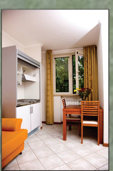
Modern Rest Rooms

Warm Welcome 24/7 Security Free Cafe & Bar