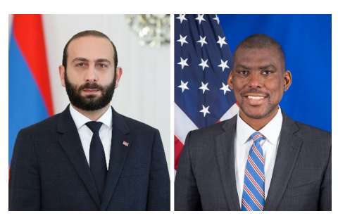
Republic of Armenia on April 11, noting that it was another manifestation of the

general aggressive policy of Azerbaijan, also aimed at disrupting the efforts to continue the peace negotiations.