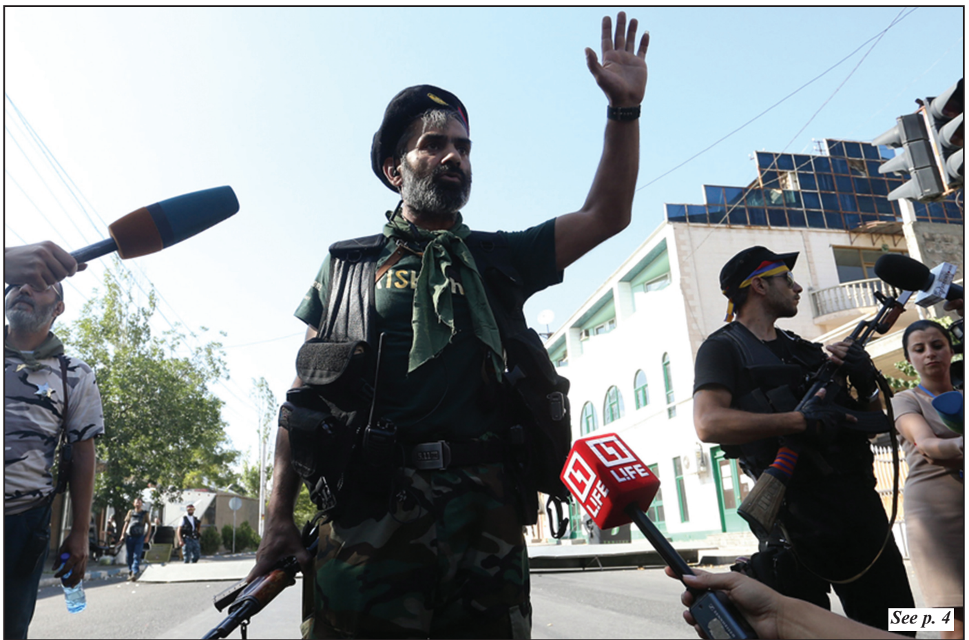
See p. 4