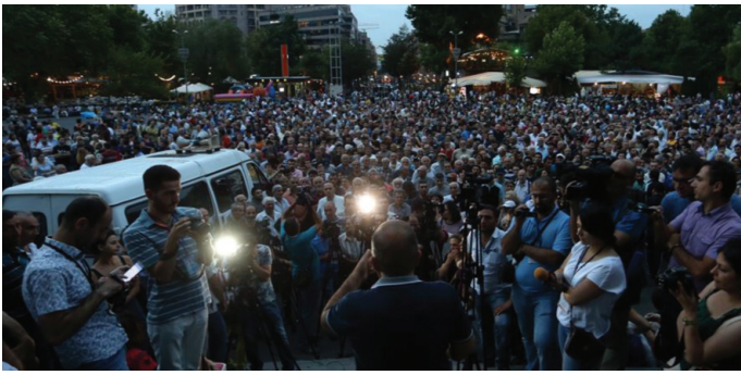
Yerevan - (RFE/RL)

More than a thousand people blocked a major street in central Yerevan late on Saturday in continuing demonstrations held in support of an armed opposition group demanding President Serzh Sargsyan's resignation.