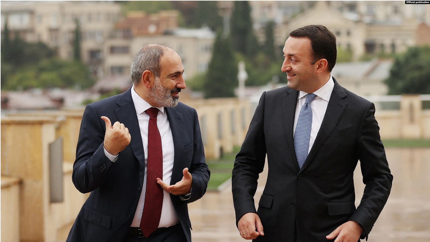
Georgia - Georgian Prime Minister Irakli Gharibashvili (R) meets with his Armenian counterpart Nikol Pashinyan, Tbilisi, September 8. 2021.

Prime Minister of the Republic of Armenia Nikol Pashinyan has wrapped up the visit to Georgia.